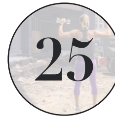
thousand square feet of fitness