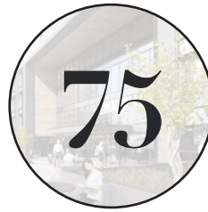
thousand square feet

Fitter Club is the premier lifestyle club for Philadelphia's growing community of business, creative and social leaders. It is designed to be members' 'home away from home' where they can socialize, exercise, work and play in an exceptional setting with modern amenities.