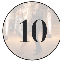
thousand square feet of event space