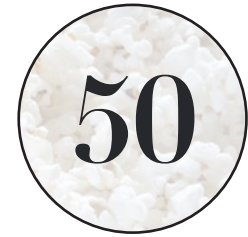
seat screening room