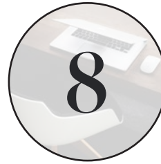
thousand square feet of private office suites & workspace