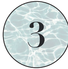
lane lap pool